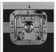
Two side strong butterfly lock