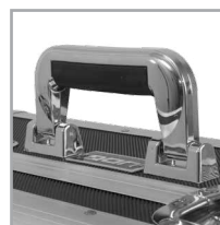
Ergonomic & sturdy carry handle