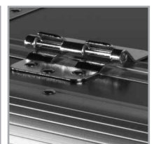
Two solid metal hinges