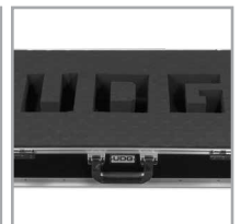
Pick & pluck foam with two separate layers