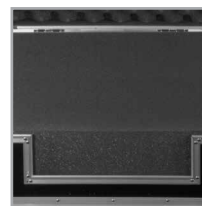
Removable front access panel