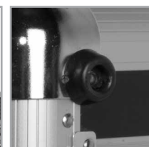
Rubber feet at the bottom for support in standing position