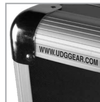
Corrosion resistant aluminum profiles with strong rounded corners